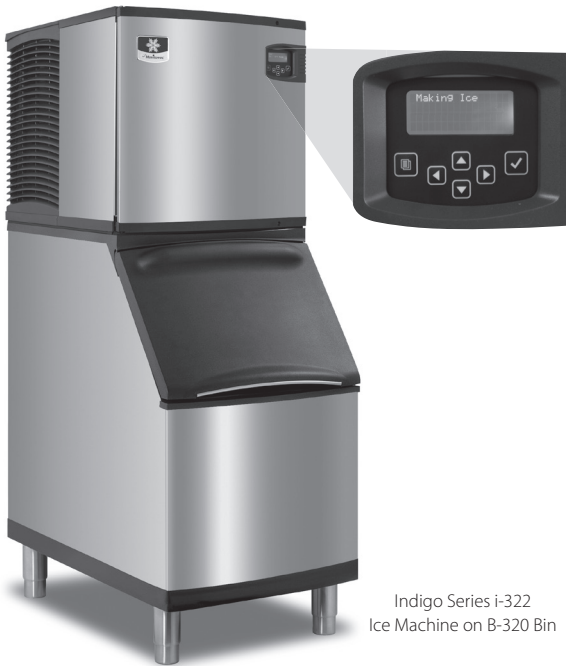
Indigo Series i-322 Ice Machine on B-320 Bin

Designed for operators who know that ice is critical to their business, the Indigo™ Series ice machine's preventative diagnostics continually monitor itself for reliable ice production. Improvements in cleanability and programmability make your ice machine easy to own and less expensive to operate.